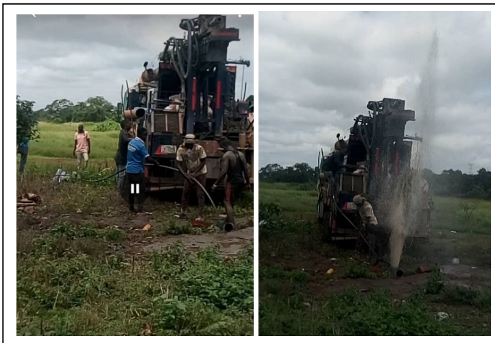
Priming the drill hole for flushing and cleaning (LHS) Flushing test prior to a pump drawdown test (RHS)

Subsequently, it is planned to conduct characterisation tests on the iron ore in conjunction with ESG programs on 'sustainability best practice targets of zero waste' to support the Community Development Agreement (CDA).